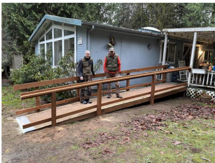
Douglas and Denny perform initial load test.