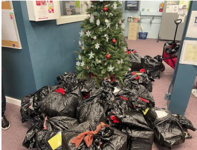
Presents ready for Santa's sleigh!

Thank you to everyone involved. Nearly $1500 was raised to to purchase gifts for children this year. The remaining costs were covered by the volunteer shoppers.